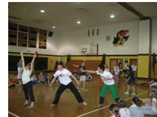
Workshop by Roxey Ballet on Bullying

Email < grants@ujeni.com > for inquiries and for assistance in the grant-writing process.