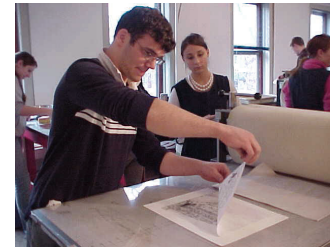
Students working on Gum Transfer process at the Ink Shop

lots of hands-on learning and scientific reasoning. • Choral group worked with professional composer to create a piece of music and performed it at the Spring Concert