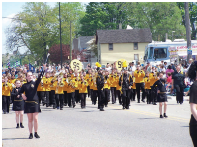
The Elementary Marching Band at the Tulip Time Festival and Kinder Parade in Holland, Michigan

August 1st and February 1st of each academic school year.