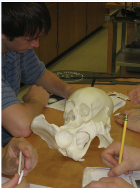
Identifying sex and continental origin of unknown skeletons

Community Foundation of Tompkins County 309 North Aurora Street Ithaca, NY 14850