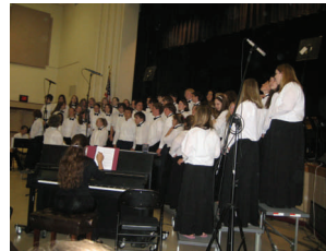
Choral group performing concert piece